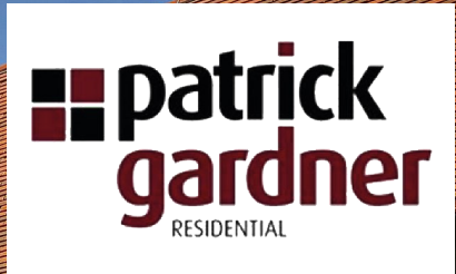
Williams Barn, 15a Reigate Road, Sidlow, RH2 8QH